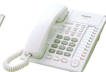
■ KX-T7750 Monitor Unit