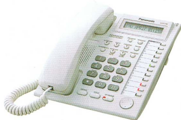
■ KX-T7730 LCD, Speakerphone Unit